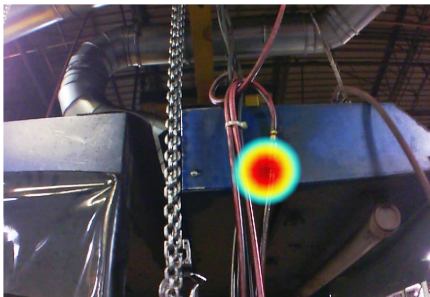
Images taken with the ii900 Sonic Industrial Imager in an industrial environment.

Fluke. Keeping your world up and running.®