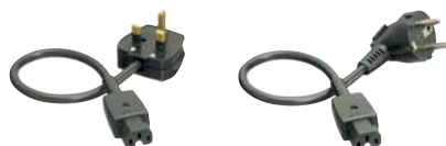
EXTL100-02 (UK plug)