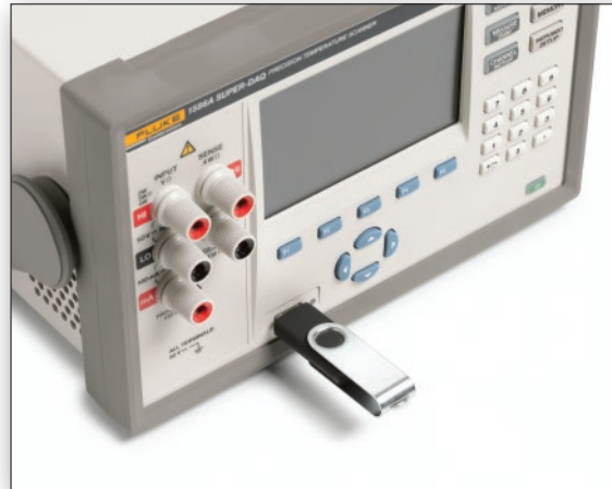
Easily transfer Super-DAQ data and setup files using a USB flash drive.

The Super-DAQ also includes two levels of data security to prevent unauthorized users from tampering with or forging test data or setup files. This security feature is especially important to industries that are regulated by government agencies where data traceability is required.