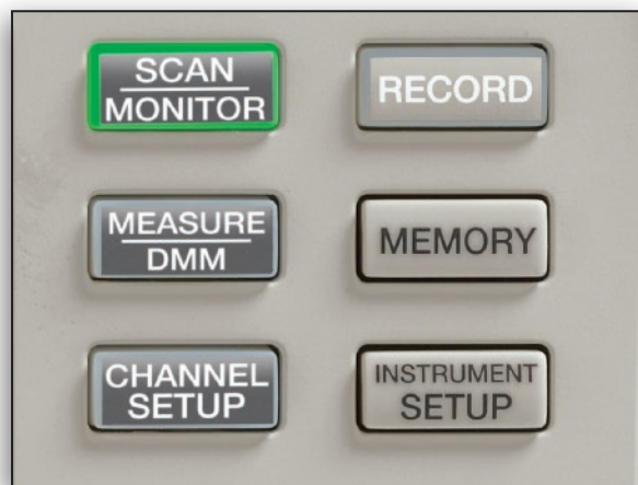
Scan, monitor, measure, and DMM function keys on the front panel.

Function keys are backlit so that you always know the mode of operation and recording status.