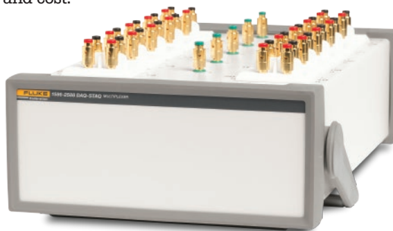
1586-2588 DAQ-STAQ Multiplexer

Universal input channels accepts 2-, 3-, or 4-wire connections to measure temperature, resistance, dc voltage, and dc current for data acquisition applications on the factory floor where channel count and scan speed are important.