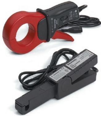
Illustration shows high performance current probes from Tektronix Inc.

Normally the probe provides a method of mechanically splitting the magnetic circuit to enable the conductor to be inserted. The position of the conductor within the loop has relatively little effect upon the measurement.